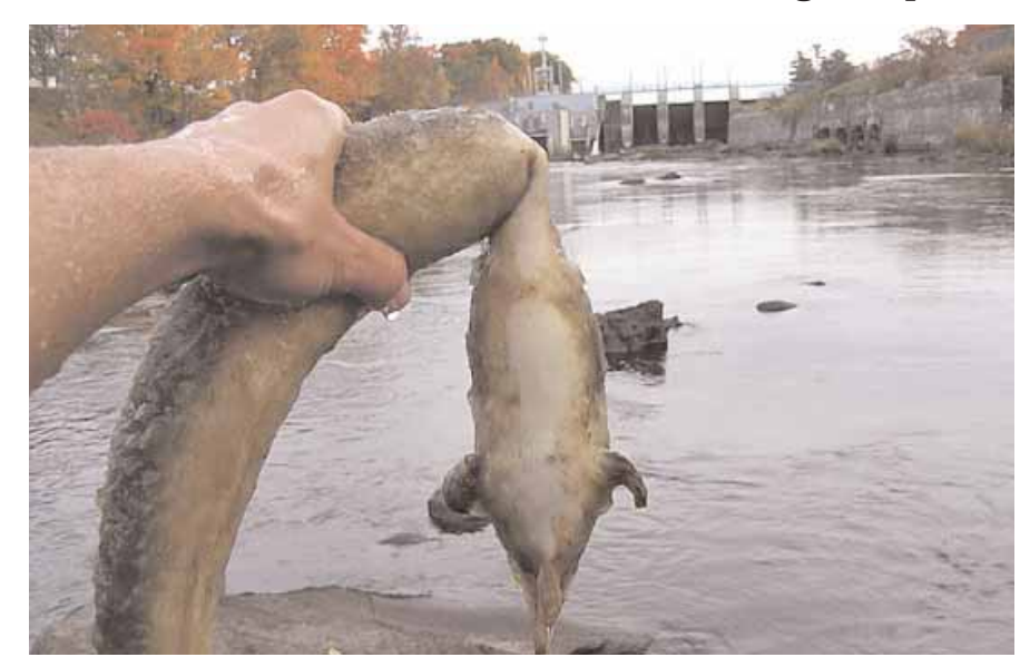
4 ft. female American Eel slaughtered by turbines of Benton Falls Hydro Dam, Sebasticook River, Benton, Maine. 14 October 2004.